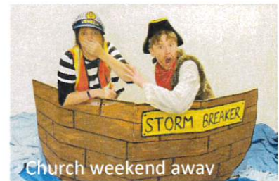
Church weekend away

There are a large number of other church activities which provide a means of friendship, encouragement, practical support and growth in Christian faith to all in the church. These cater for different ages, genders and interests, and contribute to the ethos and life of the church. They are a means of encouraging new people to come among us and benefit from what we provide. Numerous special events and regular activities took place during the year to provide opportunities for deepening friendships. In November 2021 we were able to hold a weekend away at the Pioneer Centre, Shropshire when 170 adults and children enjoyed teaching, fellowship and friendship together.