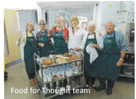
Food for Thought team

Our regular groups and meetings include monthly curry club, banner making group, craft group called Creative Hands and Hearts, Food for Thought (monthly lunch club for those around during the day), Friends Café (monthly support group for widow(er)s), monthly prayer breakfast, monthly prayer and worship evening, weekly prayer meeting, and the CBSingles group. The Time Out Café is open weekly on Wednesday mornings for coffee, cake and a chat. All of these groups have been able to restart in 2021 having stopped the previous year. They are slowly growing again.