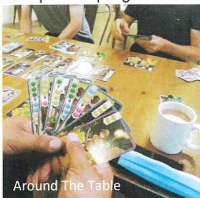
Around The Table

Twice monthly games evening called Around the Table continued online and then in person as the year progressed. This is also now growing again.